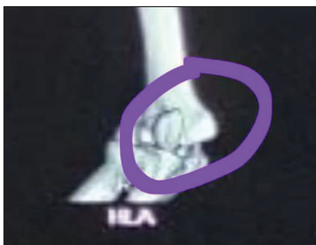
Fig-3: 3D CT scan of elbow showing the isolated trochlea fracture.

An ORIF(Open reduction internal fixation) was done through medial approach and fracture was fixed with Herbert screws. (Fig-4, Fig-5) Post operatively early range of motion exercises of the elbow was commenced. Patient regained nearly full elbow range of movements.