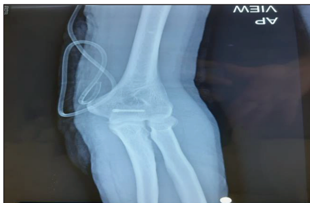
Fig-4: Radiograph AP-view shows fracture fixation via headless screw.

An ORIF(Open reduction internal fixation) was done through medial approach and fracture was fixed with Herbert screws. (Fig-4, Fig-5) Post operatively early range of motion exercises of the elbow was commenced. Patient regained nearly full elbow range of movements.