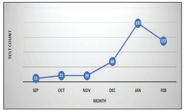
Fig-1: The Number Of Tests Requested Month Wise

In total, 454 samples were tested for influenza A, Influenza B and RSV in 6 months of the post COVID-19 period from September 2022 to February 2023. The test count of every month was reviewed and analyzed. The number of test requests for respiratory viral infections were significantly higher 88.5% (402/454) in the last 3 months of winter season (December, January & February) as compared to 11.5% (52/454) in the earlier 3 months (September, October & November) as shown in Fig-1.Overall, Influenza A was the most common respiratory virus detected with a prevalence of 26.4% (120/454 cases). Whereas RSV was the second most common respiratory virus detected with a prevalence of 10% (46/454 cases) while Influenza B was found to be 6% (27/454 cases) as shown in Fig-2.We found no coinfection in the children group. However, Influenza A and Influenza B coinfection was seen in only one person from the adult group whereas Influenza A and RSV coinfection was seen in two persons from elderly group.