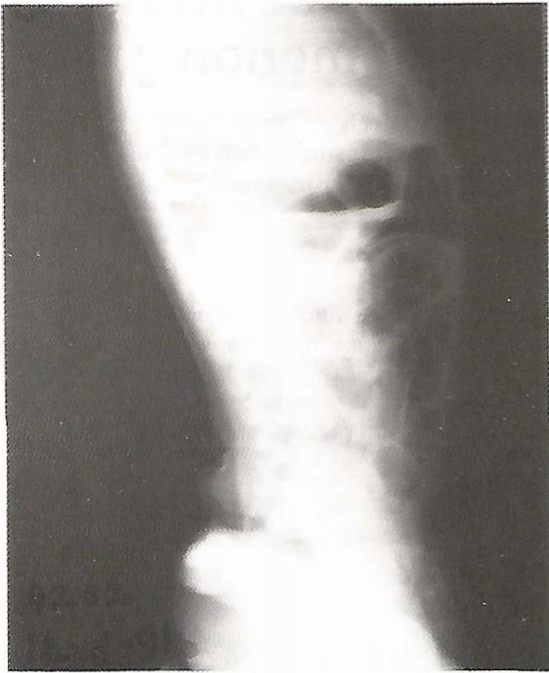
Fig. 2: X-ray chest (lateral view).

According to Malon et al 2 , the most common presenting feature of herniation of the liver diaphragmatic hernia is failure to thrive as was indeed found in our case. Other modes reported are abdominal pain, vomiting, chronic respiratory symptoms or in instances, no symptoms at all. The condition is suspected when the diaphragm is not clearly visible on X-ray 3 .