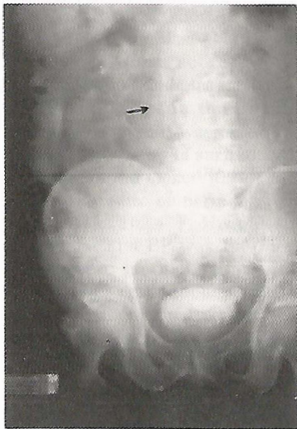
Fig. 2: Kimray - greenfield filter (arrow) in inferior vena cava below the renal veins.

are unreliable 2 . High resolution real-time ultrasonography supplemented by colour Doppler imaging is increasingly accepted as a highly accurate, non invasive technique to establish the diagnosis 3 .